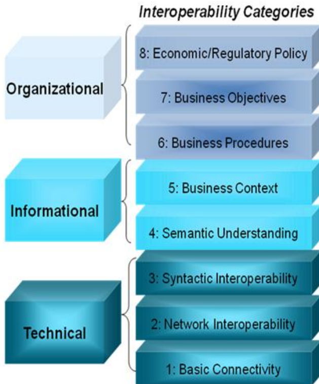
Figure 1 GWAC Stack [9]

The principles laid out by NIST to guide development of the interfaces of the smart grid [1] offer compatible advice. The interfaces should support: