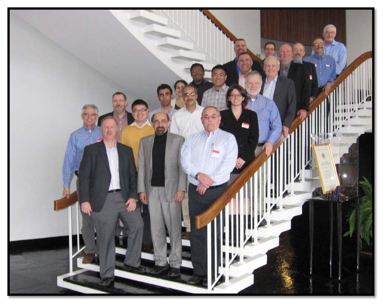
Attendees of the 2012 Workshop